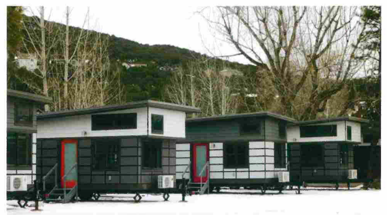
In an effort to make up a 600 bed deficit, Aspen has purchased six trendy new tiny houses.

Officials with Aspen Skiing Co. — which owns and operates the iconic Aspen Snowmass in Colorado — tell the Aspen Times that the company <u>is currently running at a 600 bed deficit</u> for its employees which have flocked to the resort for the winter season.