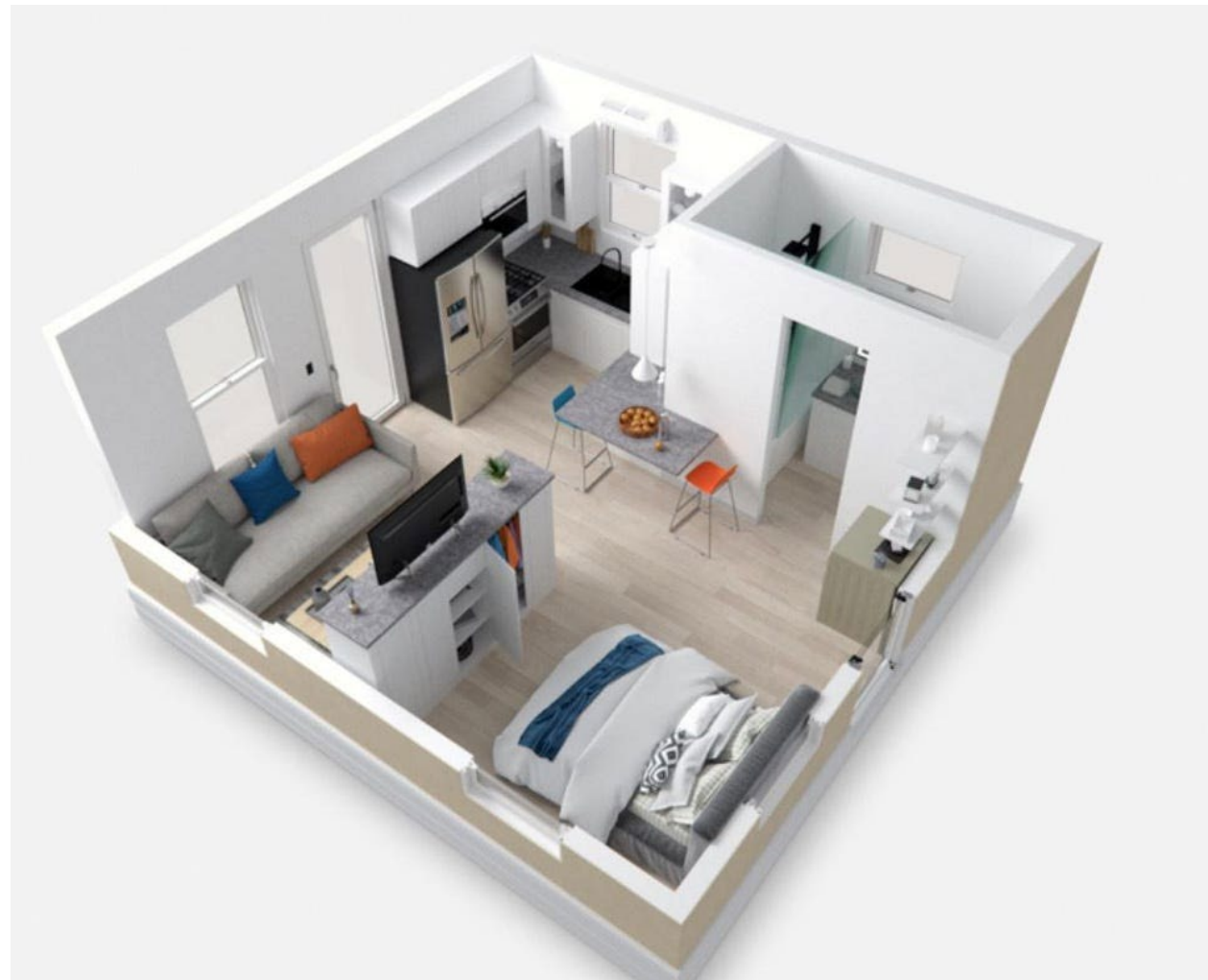
Boxabl's first product - a 20'x20' prefab studio apartment that unfolds from a shipping container

Tiramani: At Boxabl we didn't just fix the shipping problem. Solving the shipping problem just made everything else possible. We re-engineered the buildings selecting different materials and manufacturing methods to make buildings that outperform on energy ratings, fire resistance, wind resistance and more. The main goal of our redesign was to make something that's more compatible with the factory. Our initial manufacturing plant should produce one house every 90 minutes, and hopefully 3,600 per year.