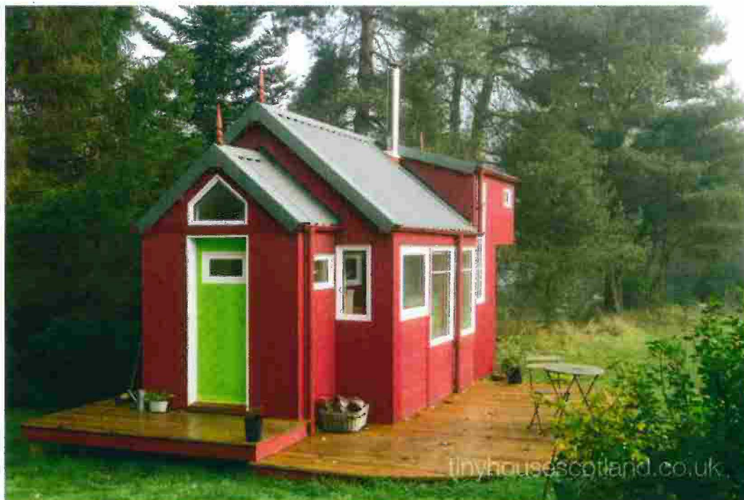
Jonathan Avery/Tiny House Scotland

Edinburgh City Council donated the land for the village, which will also include a vegetable garden, chicken coop, and furniture workshop.