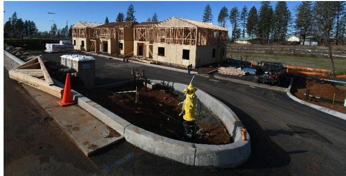
Eaglepointe Apts, 5975 Maxwell Drive, Paradise

Eaglepointe Apartments, Paradise (43 units, family, The Pacific Companies/BCAHDC. Lender and LIHTC investor: KeyBank) Eight construction draws have been processed. Construction is out of the ground and buildings have been framed and enclosed.