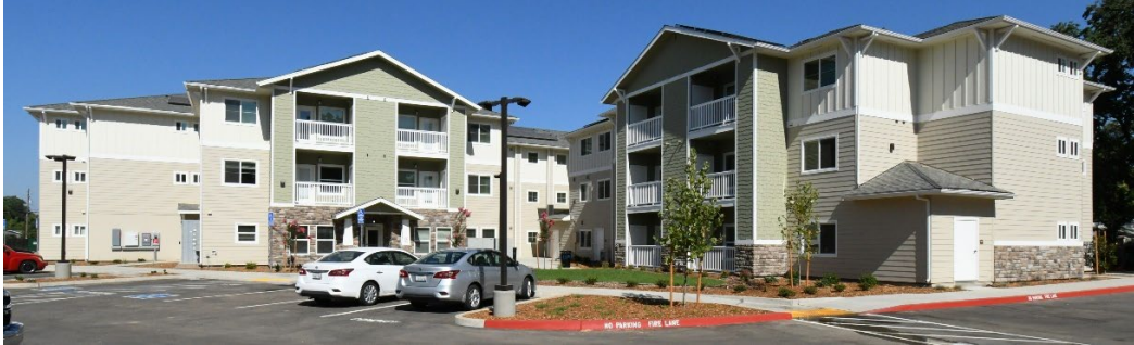
Sunrise Village Apartments, 1460 Hwy 99, Gridley

2023 - Sunrise Village Apts, Gridley (37 units, seniors, The Pacific Companies/BCAHDC) Building construction is complete, Notice of Completion was filed June 6, 2023. 36 Section 8 Vouchers will serve the low-income occupants. Lease-up is complete. Property management reporting protocols are being established with the AGP and the property manager, Cambridge Real Estate.