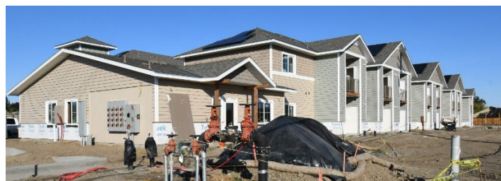
Liberty Bell Courtyard Apartments, North 6 th Street, Orland

Liberty Bell Apts, Orland (32 units, seniors, The Pacific Companies/BCAHDC. Lender: Pacific Western Bank, LIHTC investor: Redstone) – Thirteen construction draws have been processed. 31 Section 8 Vouchers have been committed to support of the low-income senior occupancy. Construction will be completed a few months following completion of the Woodward Apts, Orland project, above.