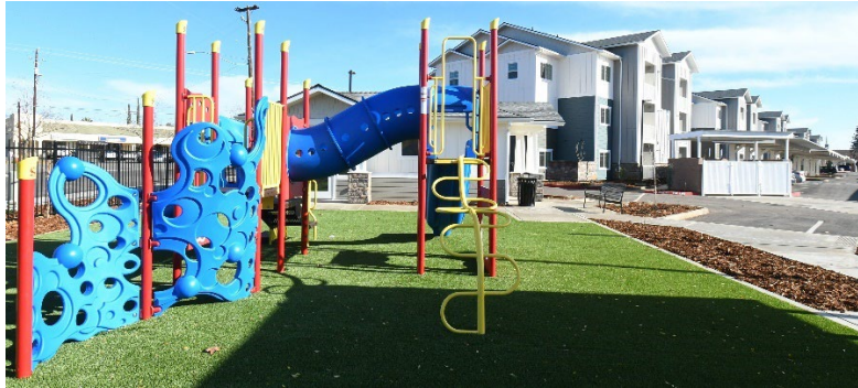
Riverbend Apartments II, 223 Table Mountain Boulevard, Oroville

Riverbend Apts II, Oroville (120 units (72/48), family, The Pacific Companies/BCAHDC. Lender: Union Bank. LIHTC Investor: CREA) This project is complete, with Notice of Completion being filed December 1, 2023. The property is leased. Property management reporting is being established with the AGP and property manager, Cambridge Real Estate.