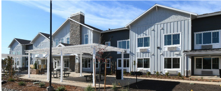
Prospect View Apartments, 145 Nelson Avenue, Oroville

Prospect View Apts, Oroville (40 units, formerly homeless singles, 15 NPLH units, The Pacific Companies/BCAHDC. Lender: Pacific Western Bank. LIHTC investor: Boston Financial) Building construction is complete, the Notice of Completion was filed January 24, 2024. HACB has committed 39 Section 8 Vouchers to this project. Leasing is now underway for this Special Needs project, with full occupancy anticipated for March/April this year.