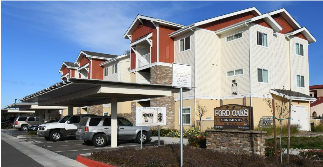
Ford Oaks Apartments, 180 Ford Avenue, Gridley

2022 - Ford Oaks Apts, Gridley (36 units, family, The Pacific Companies/BCAHDC. Lender: Umpqua Bank. LIHTC Investor: CREA) The project is complete and was fully leased as of August 23, 2022. Loan conversion is in process. BCAHDC is coordinating with partner, The Pacific Companies, to generate monthly and quarterly financial and management reporting.