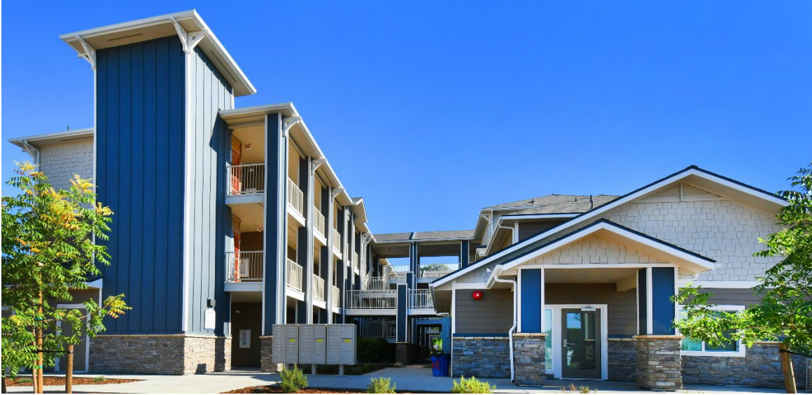
Mitchell Avenue Apartments II, Mitchell Avenue, Oroville

2023 - Mitchell Ave Apts II, Oroville (71 units, seniors, The Pacific Companies/BCAHDC. Lender: Pacific Western Bank. LIHTC Investor: Phase I, Redstone; Phase II, The Richman Group) Phase II filed its Notice of Completion on November 1, 2023. The property is fully leased. BCAHDC is coordinating with partner, The Pacific Companies, to generate monthly and quarterly financial and management reporting.