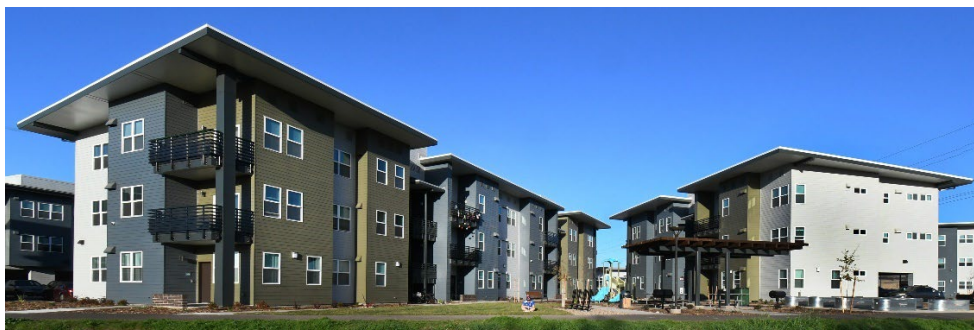
North Creek Crossings Apartments II, Meriam Park, Chico

2023 - North Creek Crossings Apts II, Chico (60 units, family, CCHC/BCAHDC. Lender: Wells Fargo/Berkadia. LIHTC Investor: R4 Capital) – Construction is complete, as is lease-up. 13 Section 8 vouchers are project-based at the property. Property management protocols are being developed with the AGP and property management company Winn Residential.