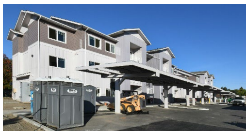
Woodward Family Apartments, 263 Swift Street, Orland

Woodward Apts, Orland (36 units, family, The Pacific Companies/BCAHDC. Lender: Pacific Western Bank, LIHTC investor: Redstone) – the project is complete; the Notice of Completion was filed January 16th. HACB committed 25 Section 8 project-based vouchers to this family project in Glenn County. Lease-up activity is underway, with property manager, Buckingham.