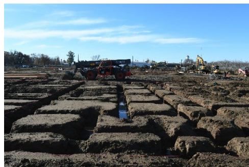
Orchard View Apts I, 1445 State Hwy 99, Gridley

Orchard View Apartments I, Gridley (48 units, family, The Pacific Companies & BCAHDC. Lender: KeyBank, LIHTC investor: Merrit Capital.) The project saw its construction close June 26 th . Construction has started, with two construction draws processed. Delivery is set for late 2024.