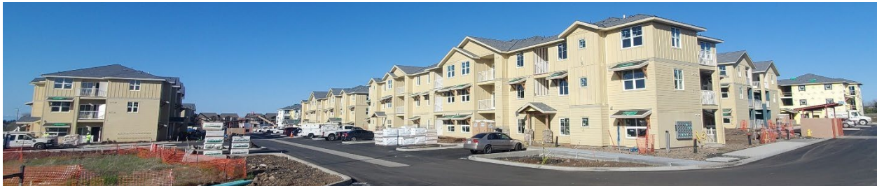
Deer Creek Apartments I & II, Highway 32, Chico

Deer Creek Apts I and II, Chico (204 units, families, The Pacific Companies/BCAHDC. Lender: Bank of America/CitiBank. LIHTC Investor: Bank of America) –Twenty-one construction draws for Phase I, and eighteen for Phase II, have been processed. Occupancy is anticipated for late Spring/Summer of 2024.