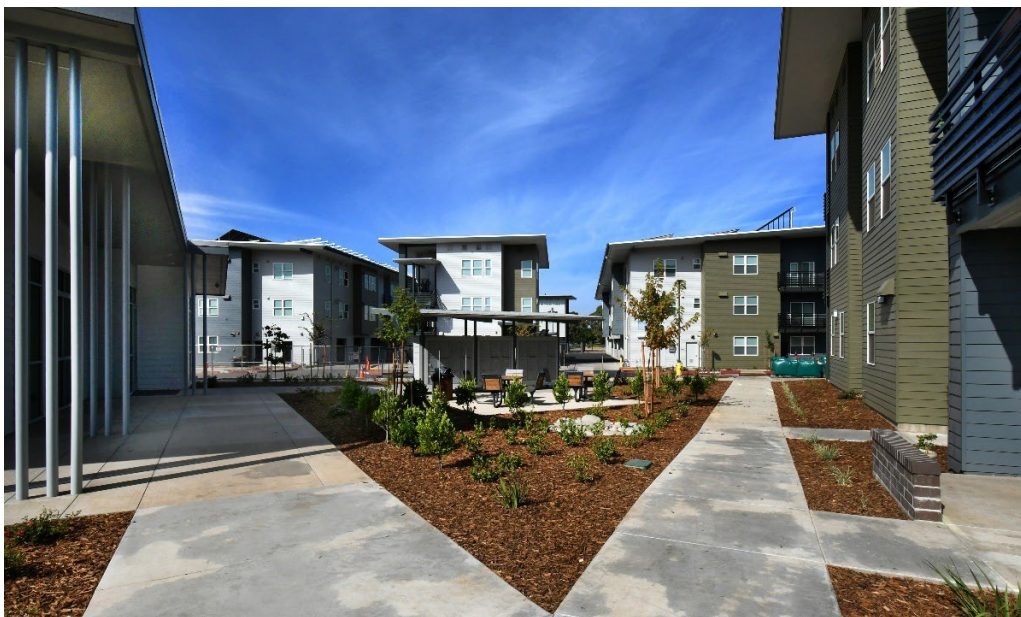
North Creek Crossings Apartments I, Meriam Park, Chico

2023 - North Creek Crossings Apts I, Chico (106 units, family, CCHC/BCAHDC. Lender: Wells Fargo/Berkadia. LIHTC Investor: R4 Capital) – located in Meriam Park, Phase I is complete and now leased. Twenty-six Section 8 vouchers are project-based at the property. Coordination with the AGP and property manager Winn Residential is underway to delivery property management reporting.