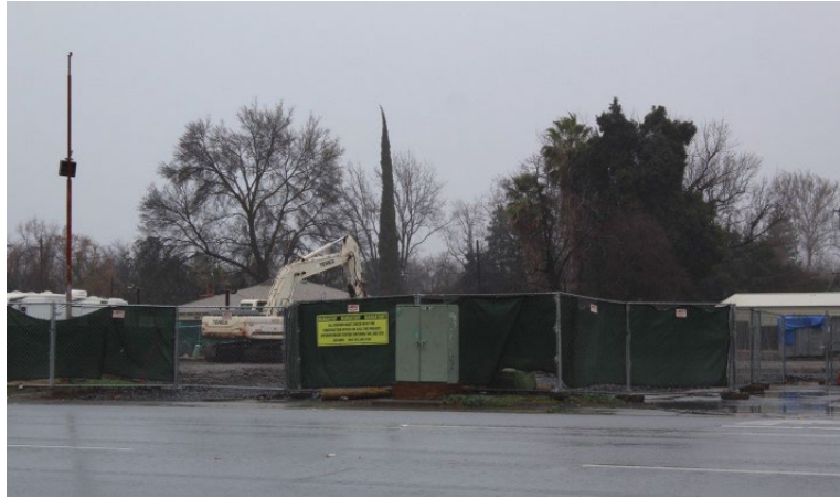
Oleander Community Housing Apartments, Esplanade, Chico – Construction start, Underground

Oleander Community Housing Apartments, Chico (38-units, special needs homeless, Pacific Companies/BCAHDC. Lender and LIHTC investor unknown at this time.) The project closed in early November and is under construction. The work is underground: foundations and utilities. Unit delivery is scheduled for Spring 2025.