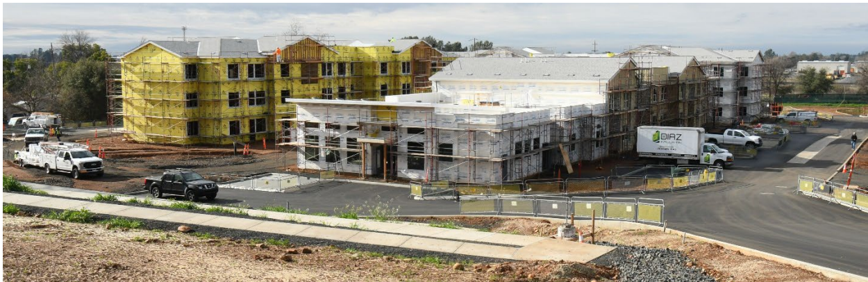
Lincoln Family Apts, 3300 Lincoln Boulevard, Oroville

Lincoln Family Apartments, Oroville (61 units, family, The Richman Group & BCAHDC. Lender: Merchant Bank. LIHTC investor: The Richman Group) Construction work is now progressing, with buildings framed and enclosed. The project is scheduled for delivery in late August 2024.