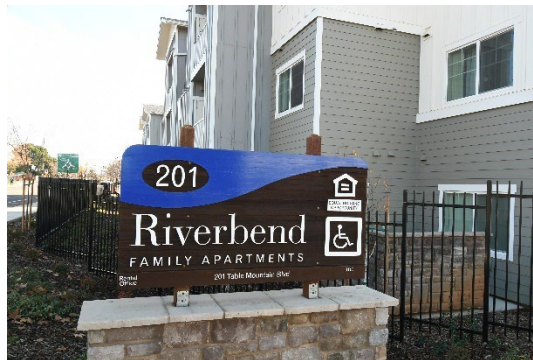
Riverbend Apartments I, 201 Table Mountain Boulevard, Oroville

2023 - Riverbend Apts I Oroville (120 units (72/48), family, The Pacific Companies/BCAHDC. Lender: Union Bank. LIHTC Investor: CREA) Phase I is complete, the Notice of Completion being filed in June. Lease-up is complete. Property management reporting is being established with the AGP and property manager, Cambridge Real Estate.